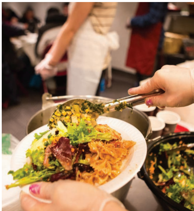
Soup kitchen at Crossroads Community Services