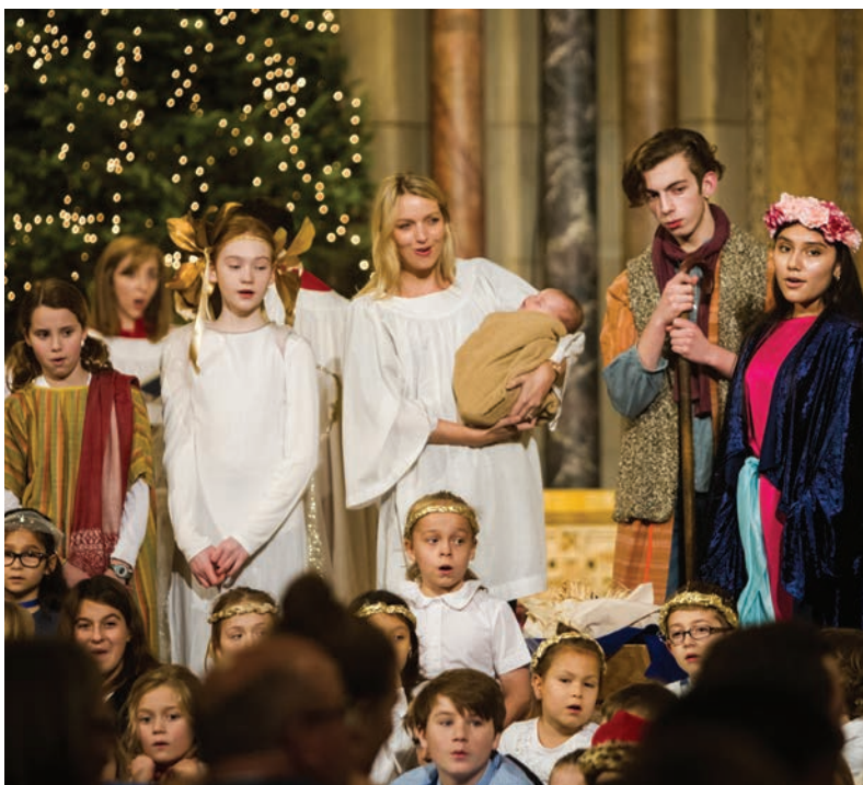
Christmas Pageant 2017