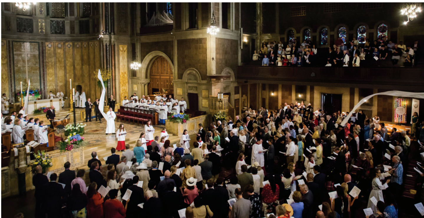
Easter Sunday 2017