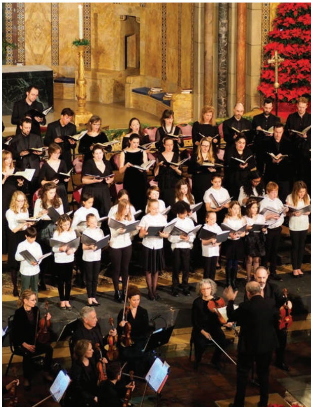
Joyous Christmas Concert on December 12