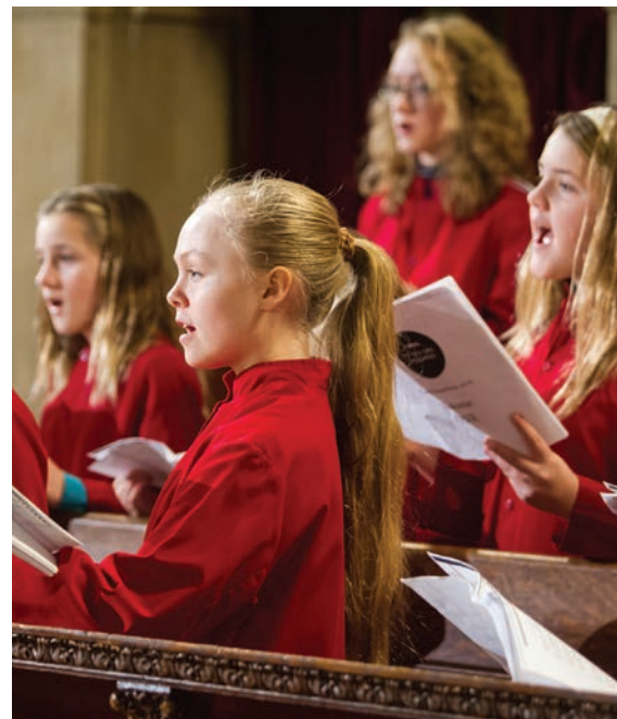
Boy and Girl Choristers

The 40s/50s Plus group met monthly for brunch, as did the LGBTQ Fellowship. The LGBTQ group also sponsored St. Bart's participation in the Pride March on June 26 and an annual Christmas gathering.