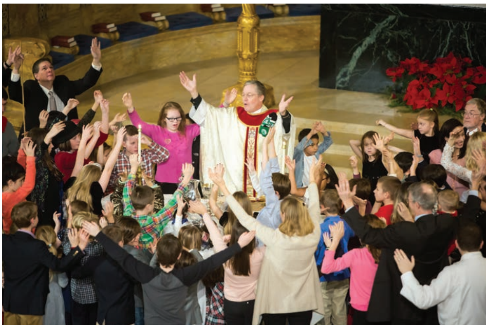
Family service on Christmas Eve