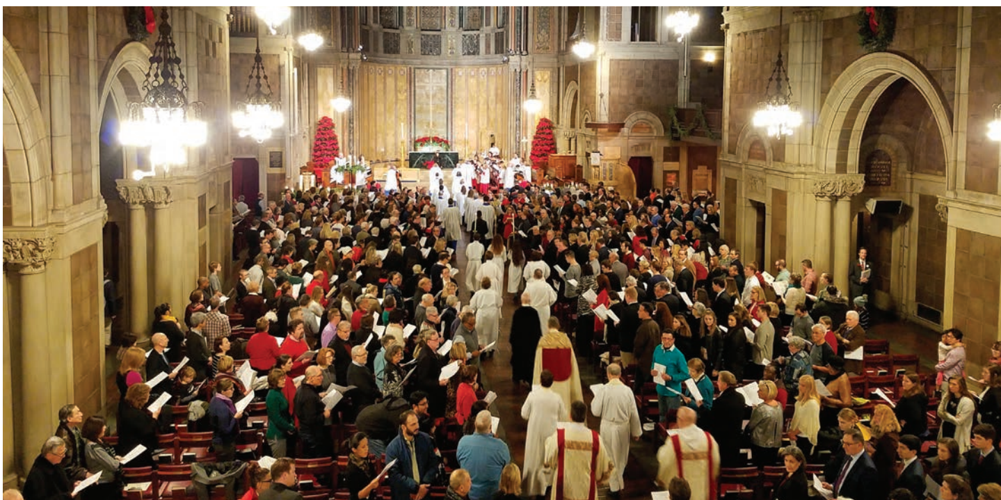
Christmas Eve 2016